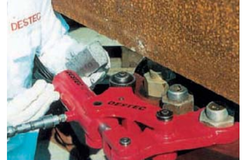
Low Height Tensioner