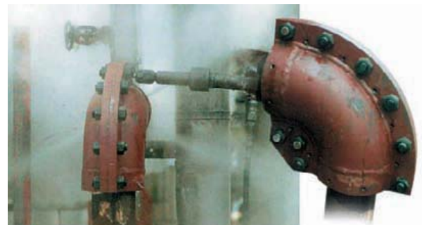
Leak Seal Box Fitted and Sealant Being Injected